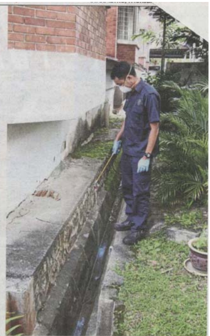
An MPKj employee spraying larvicide in a drain at a residential area in Kajang.

"If there is an increase in the number of premises outside malls with claw machines, we will reconsider relooking at the licensing requirements," he said.