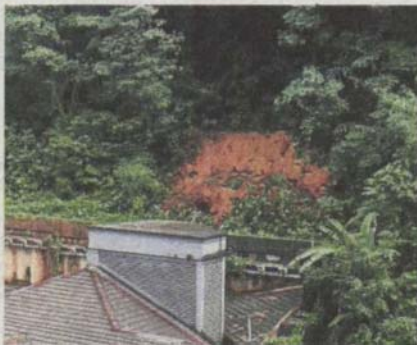
A photo of the landslide taken on Sunday at Phileo Damansara II in Section16, Petaling Jaya.

A CHECK by Petaling Jaya City Council (MBPJ) reveals that the land affected by the soil erosion in Section 16 comes under the purview of the Phileo Damansara II management.