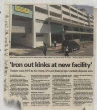
StarMetro's story that was published yesterday.

During the meeting, Shamsul also informed the councilors that MPS had collected RM91.42mil out of RM103mil in assessment as of Sept 30 and another RM4.84mil in assessment arrears out of RM7mil.